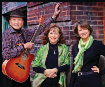
The Green Spirit Band