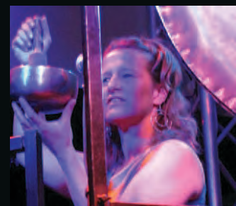
Gong Meditation with